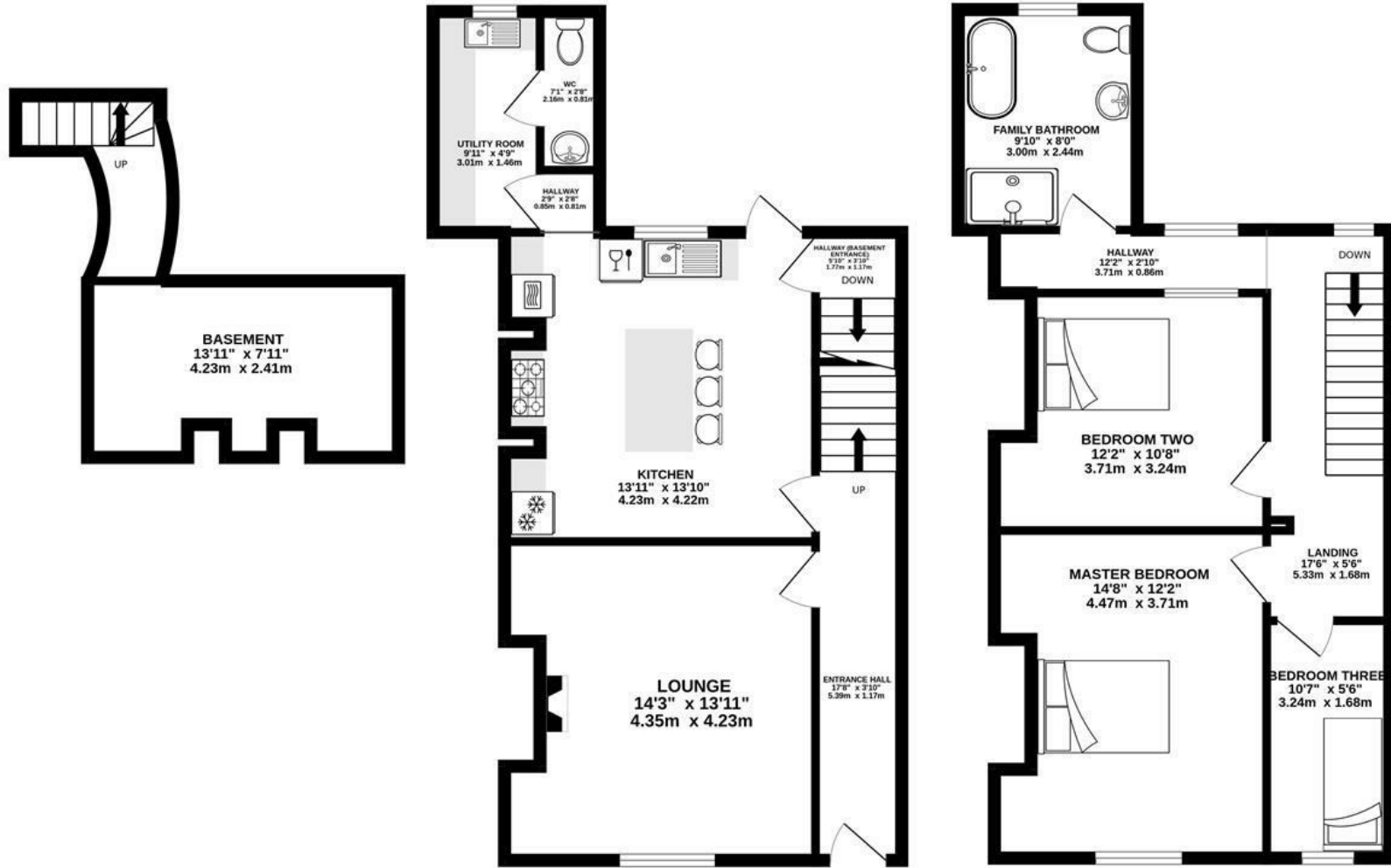
1ST FLOOR 556 sq.ft. (51.6 sq.m.) approx.

TOTAL FLOOR AREA : 1256 sq.ft. (116.7 sq.m.) approx.